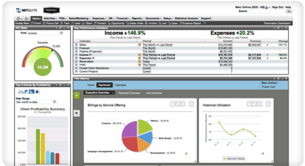
Configurable dashboards and reporting allow every manager real-time, personalized access to key metrics such as resource utilization, profit margins, and project budget vs. actual.