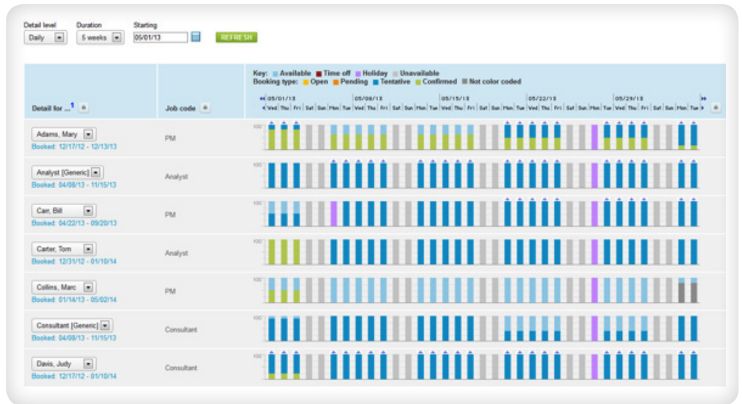
A graphical view of how your team is being utilized provides instant visibility and access.